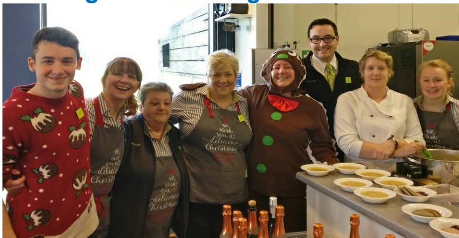
Neuro Central members treated to Christmas Lunch courtesy of Waitrose, Stirling

We aim to advance the health of people living with neurological conditions